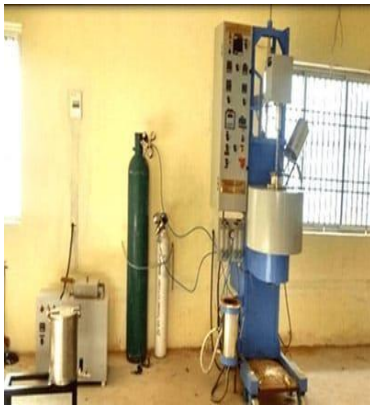
Figure 1. Stir Casting setup