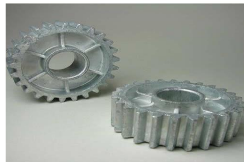
Figure 2. Nomenclature of a Gear