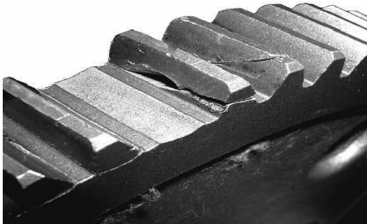
Figure 3 Tooth Breakage

It is the most dangerous gear failure result of high loads of either impact or static action. Repeated overloads causing low endurance fatigue. To overcome this gear material of sufficient strength will be selected (Figure 3).